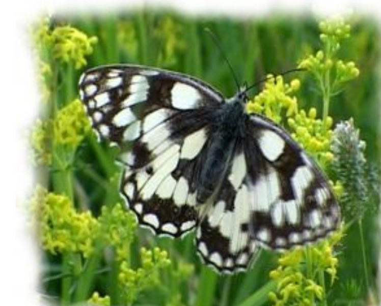
The Marbled White butterfly can be seen in mid-summer.