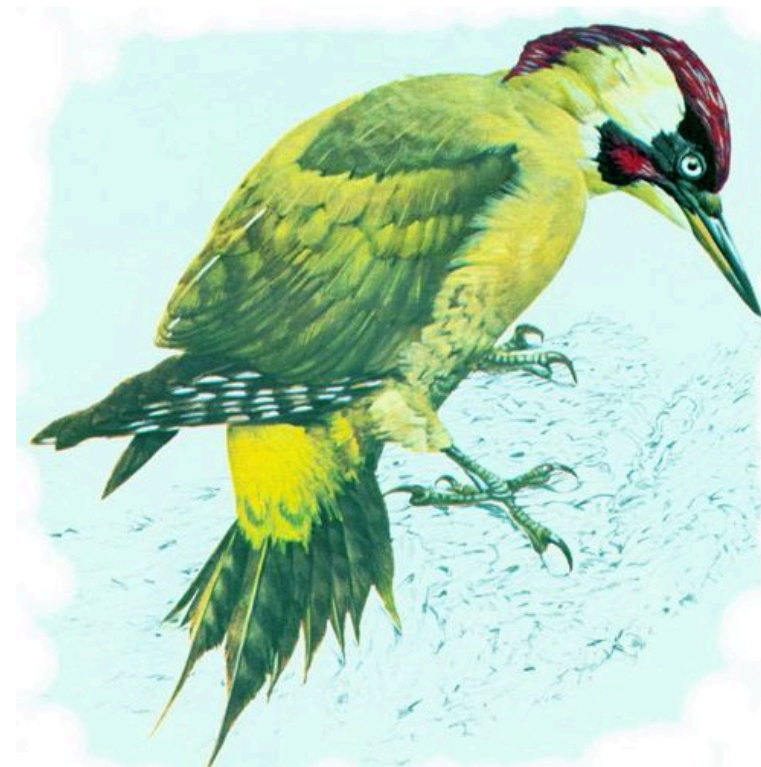
Green Woodpeckers are often heard in the trees at the top of the hill. They feed on the large anthills on the upper slopes of the field.