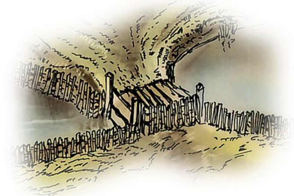
Artist's impression of the sluice gate between the pond and moat

Moats were usually dug as a status symbol and not for protection. Within the moat, a timbered building like the one shown here might have existed although only a further survey will establish this.