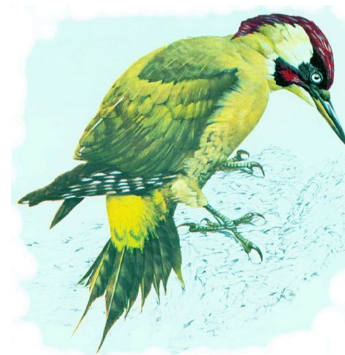
Green Woodpeckers are often heard in the trees at the top of the hill. They feed on the large anthills on the upper slopes of the field.

The ponds, stream and other wet areas are good for amphibians like the Common Frog, Grass Snake and Dragonflies, whilst mature Oak and Ash trees provide nesting holes for Woodpeckers and daytime roosts for bats.