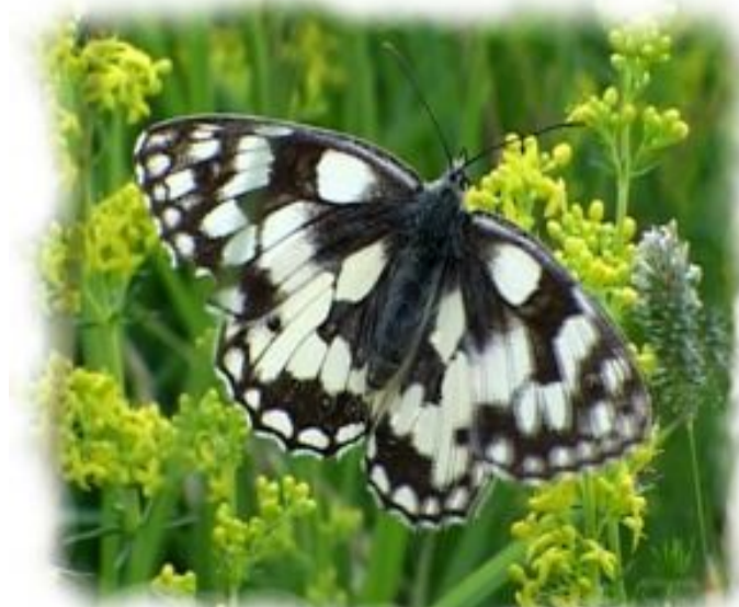
The Marbled White butterfly can be seen in mid summer. Worcestershire is its most northern territory

This type of wildflower meadow supports many different types of creatures such as butterflies like the Marbled White, and birds like the Green Woodpecker